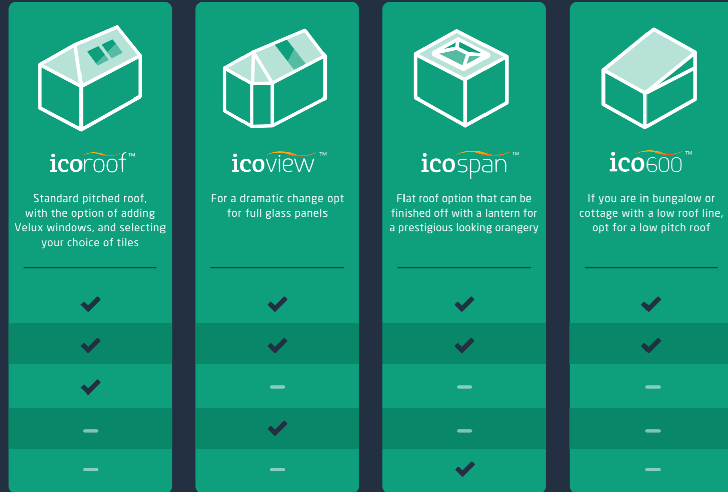
Illustration showing how our flat roof Icospan, fitted with a glass lantern, can help create a beautiful orangery.

Use the table below to select the best roof option for you: