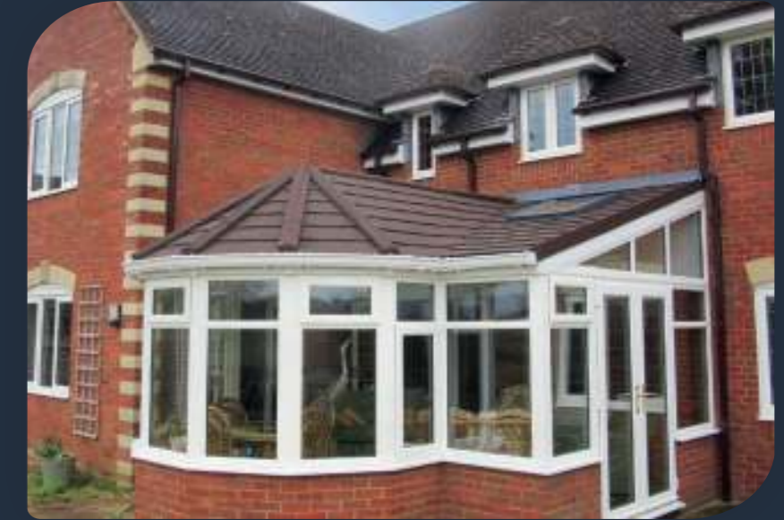
Combination extension layout, with Icotiles and Velux.

Thanks to the flexibility in design offered by a timber solution, you can opt to have a completely bespoke room, with an Icotherm roof to match.