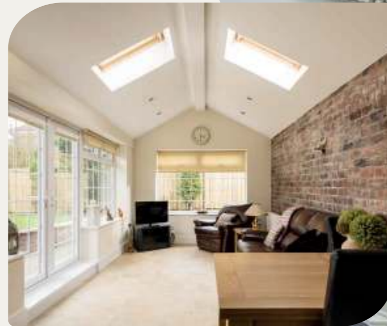
Icoroof with Velux windows

Icotherm's roof solutions offer you all the options you need for a standard conservatory roof replacement or a bespoke new build to match your property. Your Icotherm roof can include Velux windows, panoramic glass panels or lanterns.